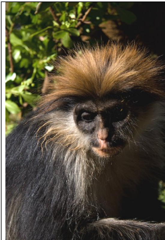
Fig. 1. Udzungwa red colobus ( Procolobus gordonorum ) endemic to the Udzungwa Mountains.

The Eastern Arc forests of Kenya and Tanzania have, as a component of the Eastern Afromontane biodiversity hotspot, been ranked among the 34 most biologically diverse areas in the world [4]. The Udzungwa Mountains have the largest area of forest cover within the Eastern Arc and have been considered of particular importance for the protection of biodiversity [5, 6]. Despite the now fragmented nature of forested areas, the Udzungwa Mountains support populations of five mammal species and two subspecies that are endemic to the Eastern Afro-Montane and the Coastal Forests biodiversity hotspot [4] as well as 12 IUCN threatened listed larger mammals (>400 g); a considerable number of new vertebrate species have been discovered in recent years (see [6]). The larger endemic mammal species in the Udzungwa Mountains include Abbot's duiker ( Cephalophus spadix ), the newly discovered grey-faced sengis or elephant shrew ( Rhynchocyon udzungwensis ) [7], and three endemic primates: Udzungwa red colobus ( Procolobus gordonorum ) (Fig. 1), Sanje crested mangabey ( Cercocebus galeritus sanjei ), and the kipunji ( Rungwecebus kipunji ), a newly described genus [8]. It is assumed that forest cover was continuous in recent historical time [5]. But previous logging and agricultural encroachment has fragmented the forests (median natural forest patch area 8.74 km 2 , [9]), reduced available habitats, and led to the threatened status of many of these species.