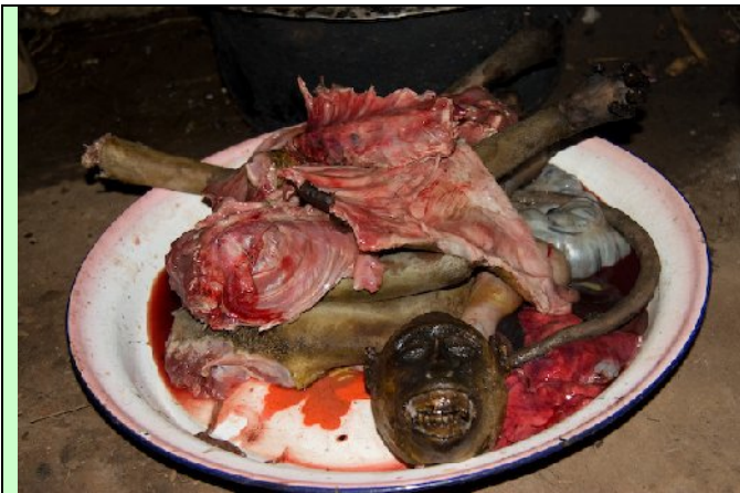
Fig. 3. Sykes monkey ( Cercopithecus mitis subsp) on the menu. Photo by M.R. Nielsen taken in one of the villages surrounding NDUFR.

Hunting has reduced the density of wildlife populations in USFR and NDUFR and the effect seems to depend on the intensity of hunting and the size of the species, although effects of differences in habitat quality as well as forest size and isolation cannot be excluded. Hunting intensity was in turn probably determined by distance to and size of surrounding human population [10, 13, 47] under the low efforts of law enforcement at the time of the study. Variations between the three locations in the opportunity costs of hunting [19, 57], access to markets [58, 59], local preferences and traditions for hunting [60, 61] may also influence hunters' incentives and contribute to the difference in hunting intensity.