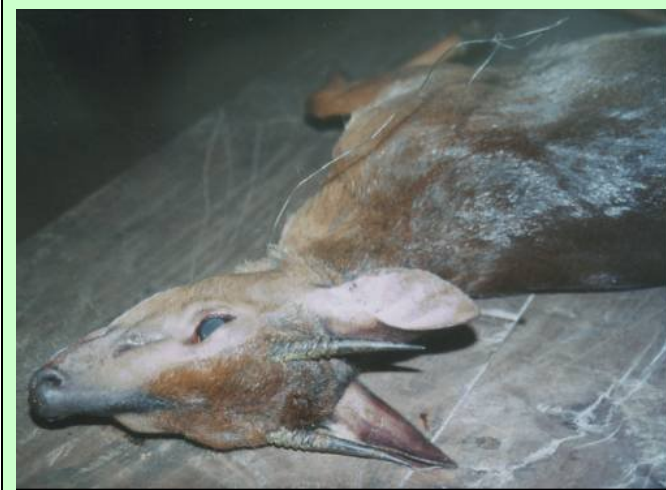
Fig. 4. Suni ( Neotragus moschatus ) caught with a cable snare. Photo by M.R. Nielsen taken in one of the villages surrounding NDUFR.