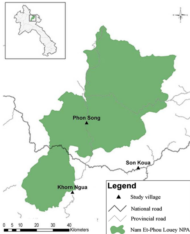
Fig. 1 Location of the three study sites in Laos. The map also shows the Nam-Et Phou Louey National Protected Area and roads

cultivation cycle. The agricultural season can be divided into four sub-periods: slash and burn, planting, weeding, and harvesting. No commercially produced fertilizers and pesticides are applied. Wild animals and plants are considered important sources of calories, protein, and essential vitamins. The main trapping and catching techniques for rodents are snares, single-capture traps, and pitfall traps.